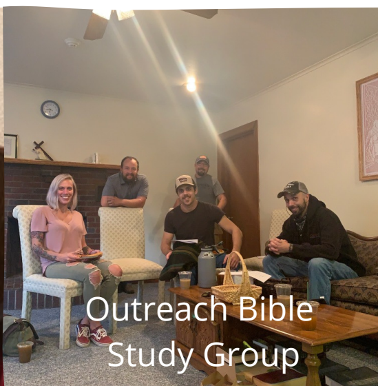
Outreach Bible Study Group